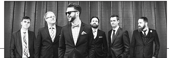
The Pork Tornadoes